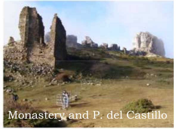
Monastery and P. del Castillo