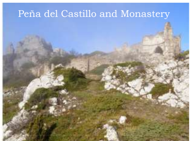
Peña del Castillo and Monastery