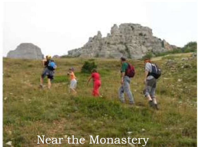
Near the Monastery