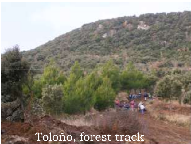
Toloño, forest track