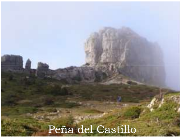
Peña del Castillo