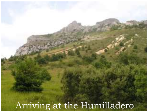
Arriving at the Humilladero