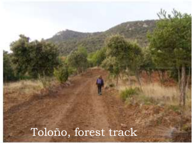
Toloño, forest track