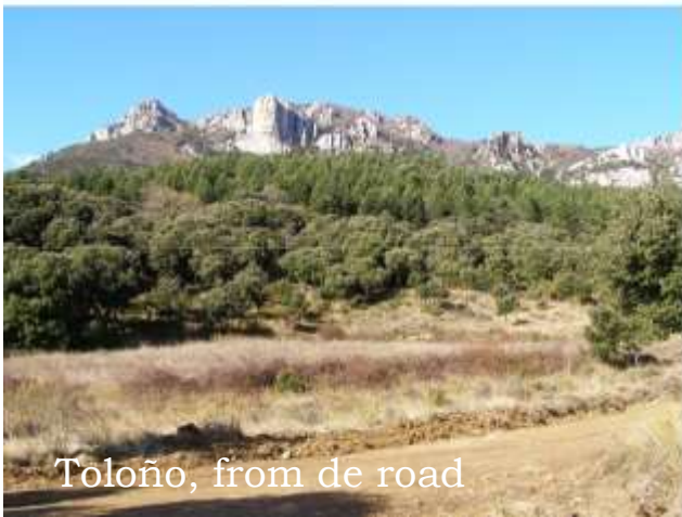
Toloño, from de road